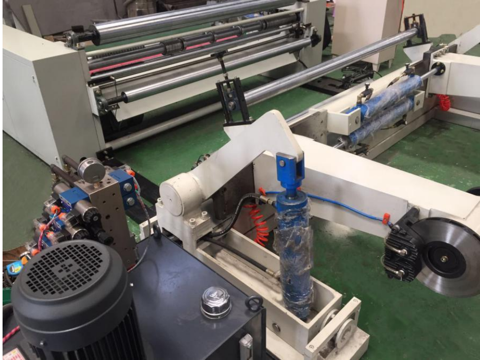
Hydraulic shaftless support 液压无轴支架